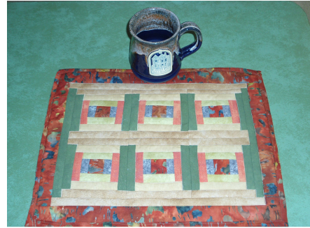
Linda Lupton – 4" Blocks

As you can see, Irene chose a 12 block setting with two borders for her sample and Linda chose a 6 block setting with two borders for her sample. You will notice that Linda alternated the color of her inner border strips. Thanks so much ladies! Below are listed the strip widths to cut for a 12" – 8" – 6" and 4" Block. Border widths will be your choice.