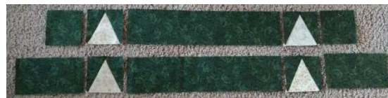
Table topper/wall hanging